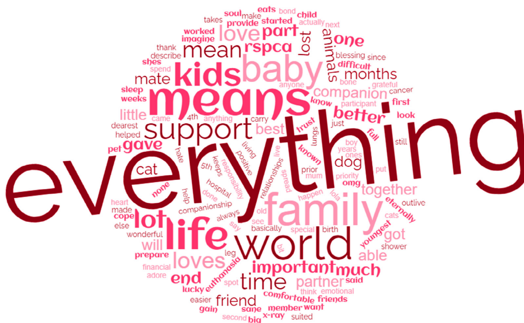
Figure 2: Word cloud of client responses to the question “what does your animal mean to you?”